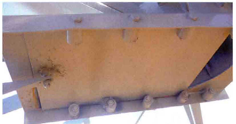
The shoot on the Worley hopper has 10 plastic bushings that the shootplate slides on. These bushings are adjustable so there is no binding or rusting.