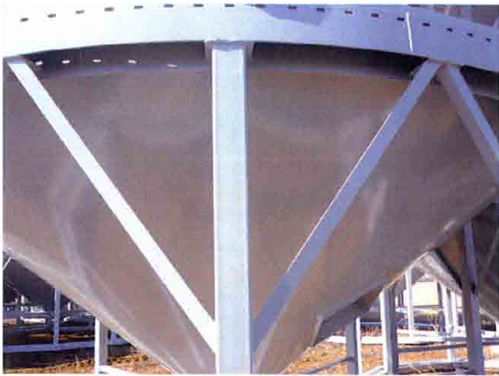
The Worley Hopper offers 2 different styles of leg braces. (Angle-Iron brace above). The strength and cost of these different braces are the same.