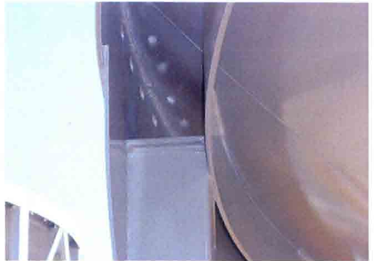
There is full access to bin-mounting holes above each leg.