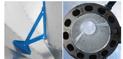
GRAIN GUARD NEXT GENERATION ROCKET AERATION SPECIFICATIONS